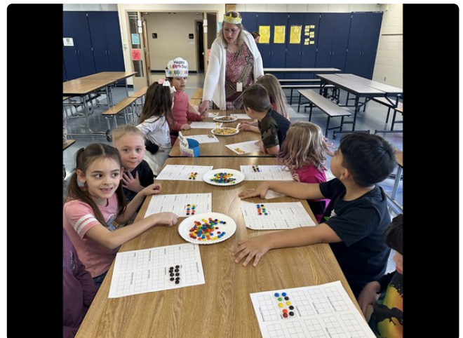
100th Day of School

Wilson Wildcats celebrated their success