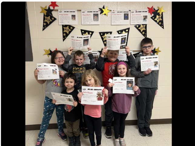
March VIP's ❤️❤️

Wilson Wildcats celebrated their success